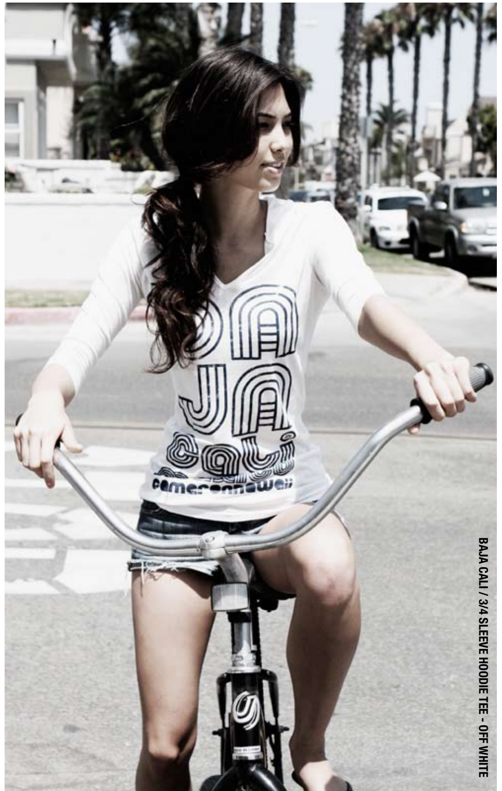
BAJA CALLI / 3/4 SLEEVE HOODIE TEE - OFF WHITE