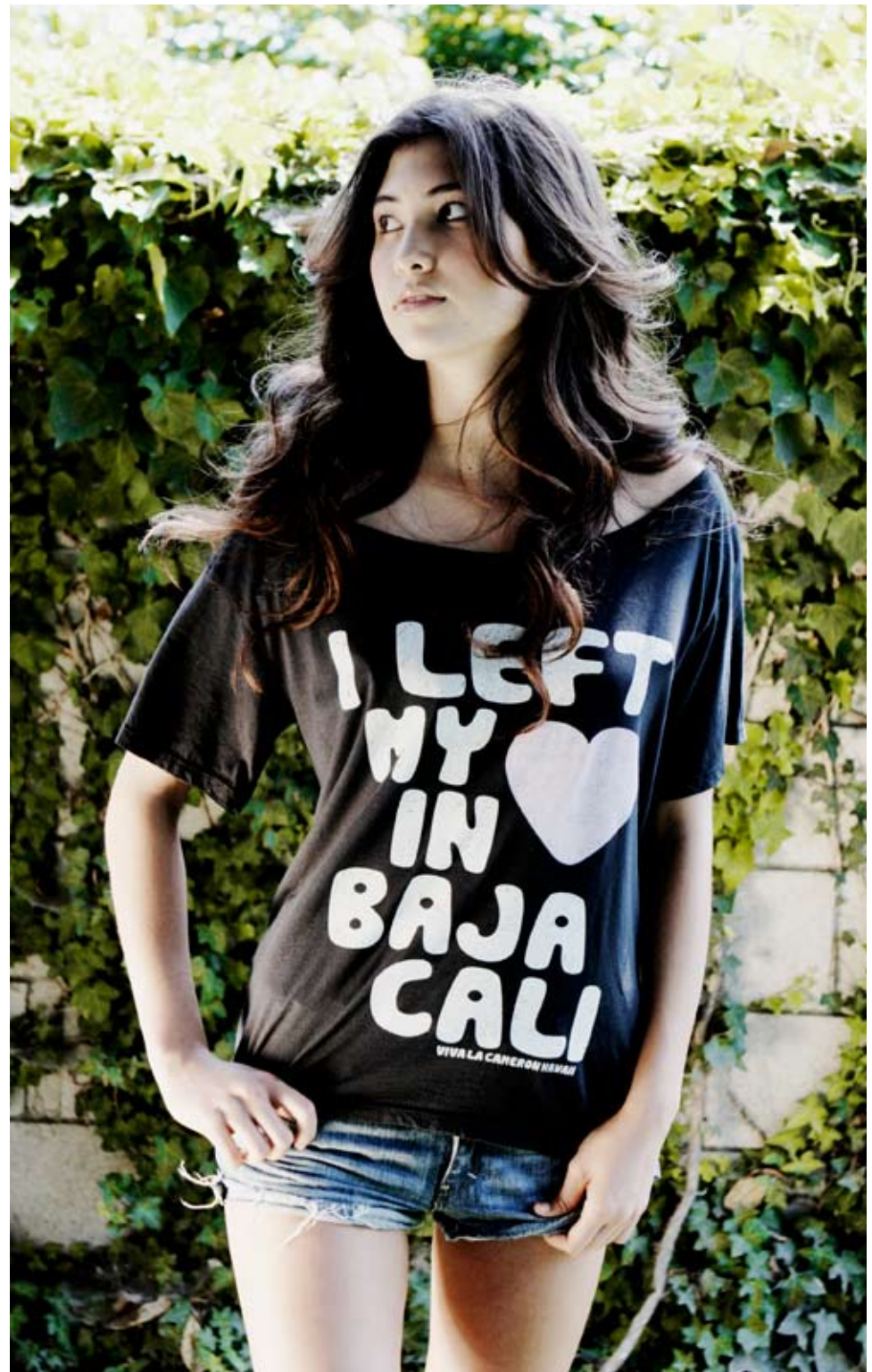
I LEFT MY HEART IN BAJA / FASHION TOP - VINTAGE BLACK